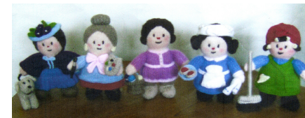
BAWDESWELL CRAFT GROUP

We are going to continue to meet over the School summer holidays but as the hall will be occupied with children's activities we will meet in member's homes. The dates are 26 th July and 9 th August. Please ring to check venues.