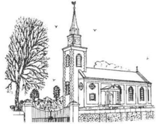
'protecting & enhancing this unique building for the future'

To say it was a success would be an understatement, the profit was a staggering £1,115, a huge amount and everybody seemed to have so much fun – it was a really enjoyable evening and very entertaining. Over 70 people enjoyed the racing and there certainly was a lot of cheering, I hope the disturbance wasn't too much for any of the hall's close neighbours?