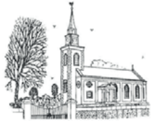
'protecting & enhancing this unique building for the future'

Thank you to everybody who supported the Quiz Night with supper on March 14th which was held at Foxley Village Hall. It was great to see over eighty supporters making up 12 teams. It was a fun evening and it seemed everybody really enjoyed themselves. Thanks must go to all those that helped with the supper, which was delicious. Well done to the winners who all took home a good bottle of wine for their efforts.