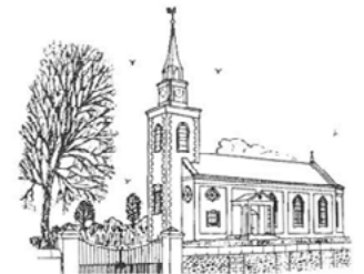
'protecting & enhancing this unique building for the future'

Keep an eye out for further details as they come available.