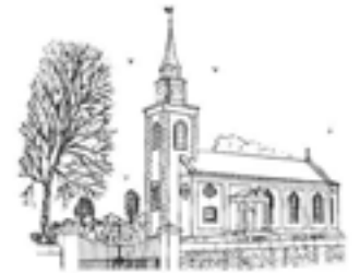
'protecting & enhancing this unique building for the future'

We had over 110 in the audience, all eating and drinking, and we lost none of the usual atmosphere we have had in previous visits from the group when we have been able to be outside in front of the church.